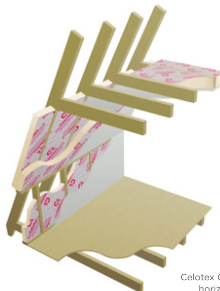
Celotex GA4000 in a horizontal ceiling