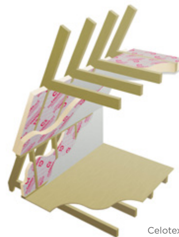
Celotex GA4000 in an attic wall application